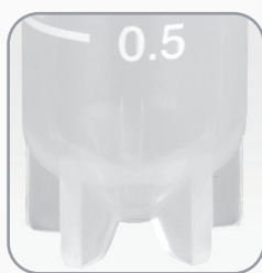
Star-shaped foot base

Coloured cap inserts – for easy identification of different samples