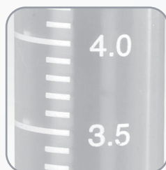
Clear graduation marks