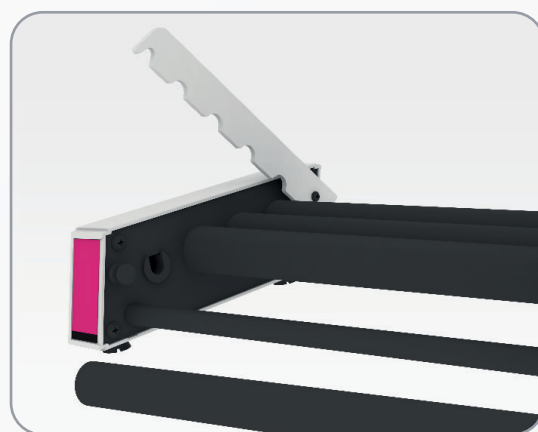
Tool-free removal and installation of rollers

Robust and space-saving design - robust construction for stable operation / small footprint requiring minimum of benchtop space